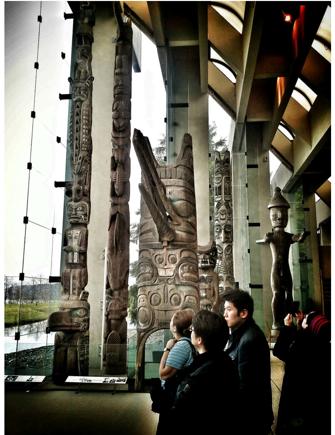
Sacred Texts and Oral Traditions class visits UBC Museum of Anthropology