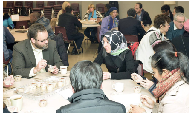
Table discussion after 'Noah's Pudding' event

Learning Opportunities: for our VST community. We organized three field trips, attended by thirty students, staff and faculty. In October, we visited the Laxmi Narayan Hindu Temple for the annual Durga Puja celebration. After the celebration, the officiating priest spoke with us about issues common to religious traditions in Canada: cultural vs. spiritual religious identity, and young adult engagement. In February, we visited Or Shalom Synagogue for a Shabbat celebration. After the service, synagogue members and guests gathered for an interfaith discussion of Biblical texts about Moses and Jesus. One day in April, we participated Surrey's Interfaith Feed the Hungry , where we learned how simple it can be to organize across faith traditions to meet community needs.