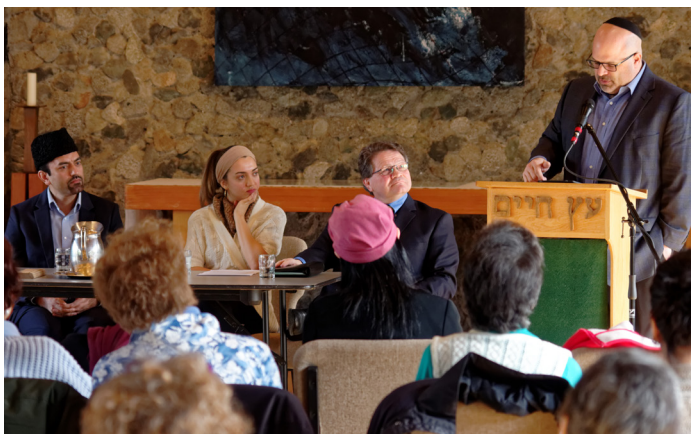
Panel Discussion: Our Home and Native Land? A Multi-faith Symposium on Refugee Settlement